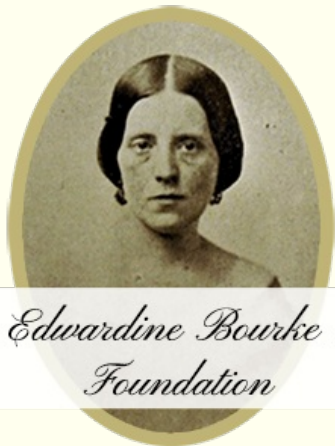
Mary Edwardine Bourke Emory Foundation